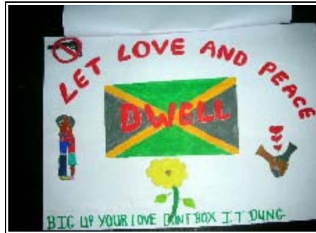
GAD 2008 Big Up Yuh Love, Doan Box it Dung Poster Competition Entry PCV Tyler—St. Mary

On September 6, 2008, the MorePeaceCorps campaign will be throwing 100 house parties across the United States. The main purpose is to generate thousands of postcards to lawmakers from all fifty states, urging doubled funding for Peace Corps. With 20 parties claimed within several days of the campaign's launch, we still have 80 parties