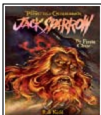
Jack Sparrow The Pirate Chase